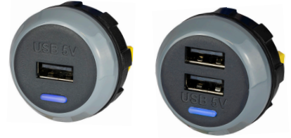
PowerVerter PVPWp-S and PVPWp-D single and double outlets.